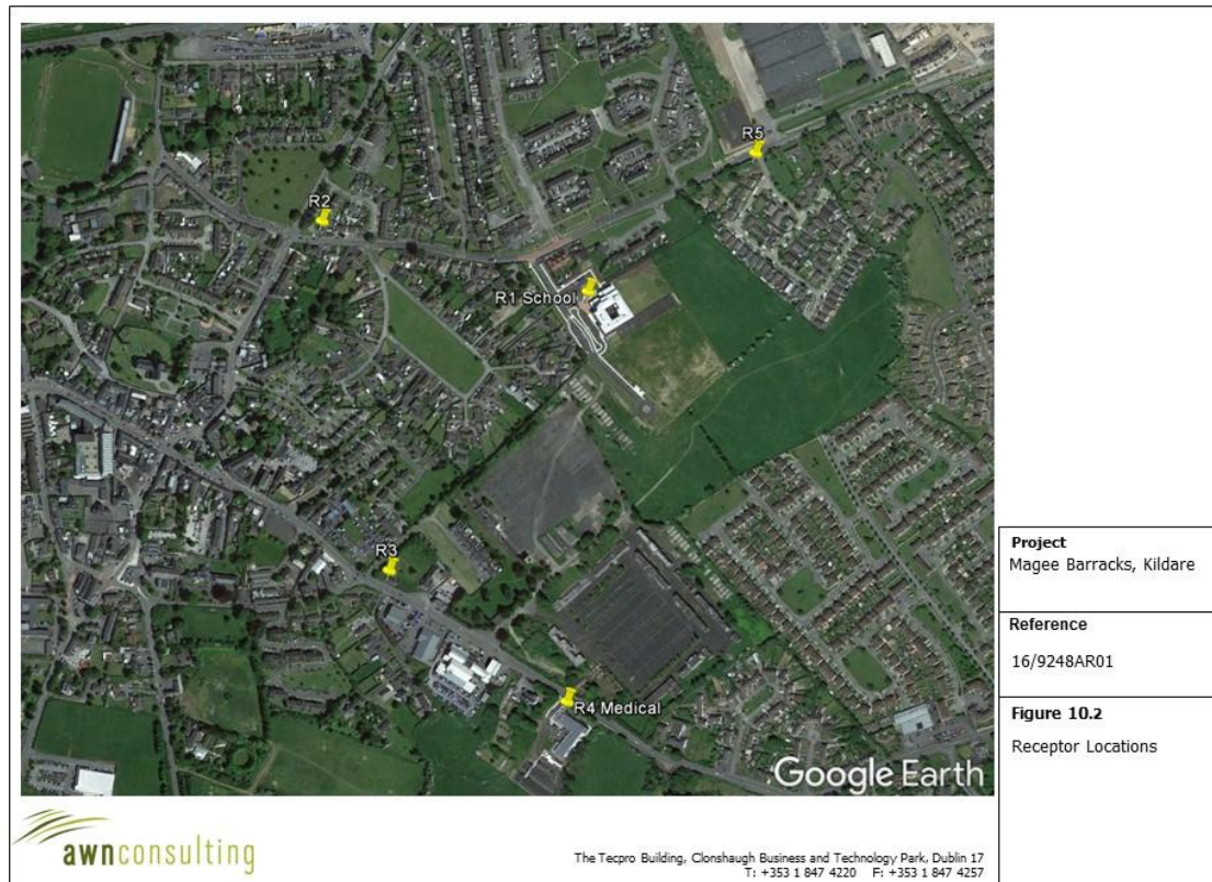
Fig. 10.2: Locations of sensitive receptors